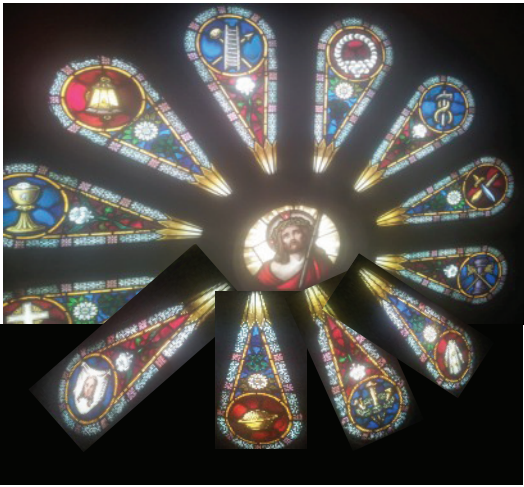
God's Handiwork It is with the smallest brushes that the artist paints the most exquisitely beautiful pictures.